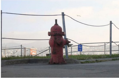
Figure 2. OK-VQA Example. Question: What vehicle uses this item? Answer: Firetruck. In our ontology Firetruck is related to FireHydrant by axioms e.g., Firetruck \sqsubseteq Vehicle \sqcap \exists hasWaterSupply.(ConnectionPoint \sqcap FireHydrant) .

which contains 14,031 images and 14,055 questions (see example in Figure 2). There are 768 seen classes and 339 unseen classes. The ontology is built with ConceptNet knowledge graph (Speer, Chin, and Havasi 2016) and a core \mathcal{EL}^{++} schema which has been operated on ConceptNet properties that connect answer concepts in OK-VQA questions. Specifically 2.3% of ConceptNet properties are involved. Figure 2 presents an example of VQA, where the potential answers of Truck and Firefighter are two seen classes in our ZSL setting while Firetruck is an unseen class.